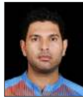
Yuvraj Singh Padma Shri Awardee