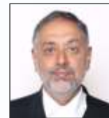
Hon. Justice G.S. Sandhawalia