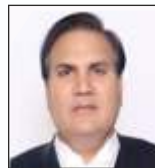
Hon. Justice Jitendra Chauhan