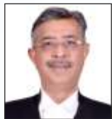
Hon. Justice Ajay Tewari