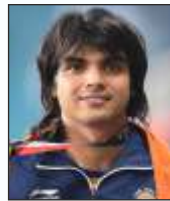
Neeraj Chopra Arjuna Awardee Padma Sri Awardee