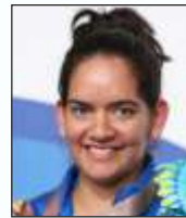
Anjum Moudgil Arjuna Awardee