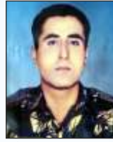
CAPT. VIKRAM BATRA, PVC