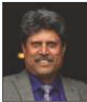
Kapil Dev Padma Bhushan Awardee