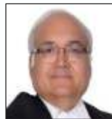
Hon. Justice Mahesh Grover