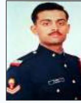
CAPT. VIJAYANT THAPAR, VC