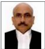
Hon. Justice Hemant Gupta