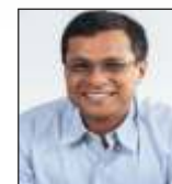
Mr. Sachin Bansal Founder, Flipkart