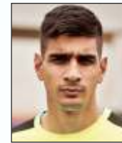
Gurpreet Singh Sandhu Arjuna Awardee