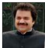
Mr. Kuldeep Bishnoi