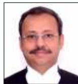
Hon. Justice Amit Rawal