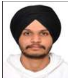
Sarabjot Singh Shooting