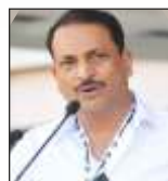
Mr. Rajiv Pratap Rudy