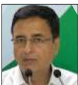
Mr. Randeep Singh Surjewala